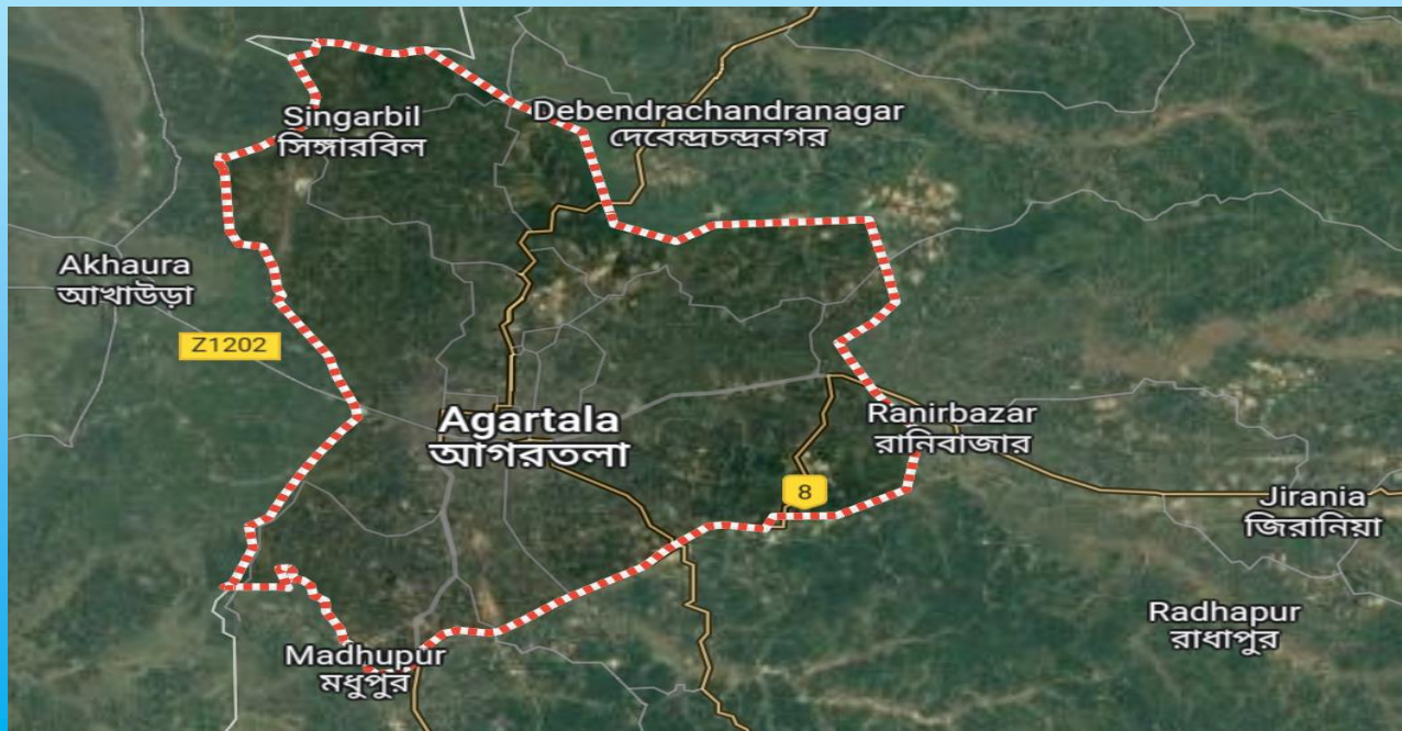
Google Map Route of Agartala, Tripura

(For Incoming Students, Parents & Visitors of NLU Tripura)